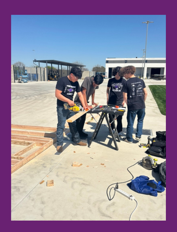
Congratulations to our construction program students who earned first place in today's building competition (see photo at upper left corner).